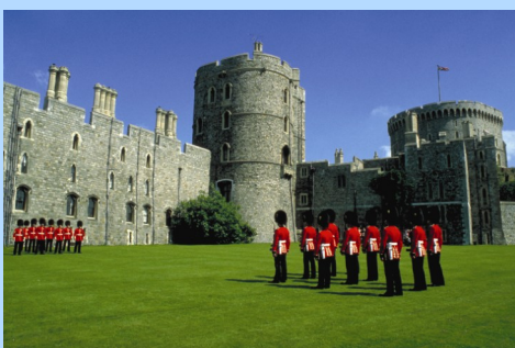
Windsor Castle and the Royal Guards