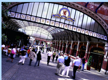
Windsor Royal Shopping

PM - An afternoon tour of Eton College ( 10 minutes from Windsor Castle ) gives a fascinating insight into one of England's oldest institutions. Founded by Henry VI in 1440 to provide 70 "worthy boys" with a free education. Today the school is a very modern institution whilst retaining its distinctive "school dress", age-old traditions, language and sports.