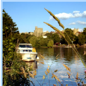
The River Thames at Windsor

PM - Take the M25/M4/A4 (90 minutes) to Taplow. Cliveden House is set amid 376 acres of magnificent National Trust managed Grade I listed formal gardens and woodlands. Standing upon chalk cliffs that give the estate its name, the house commands panoramic views over beautiful countryside and an idyllic bend in the river Thames.